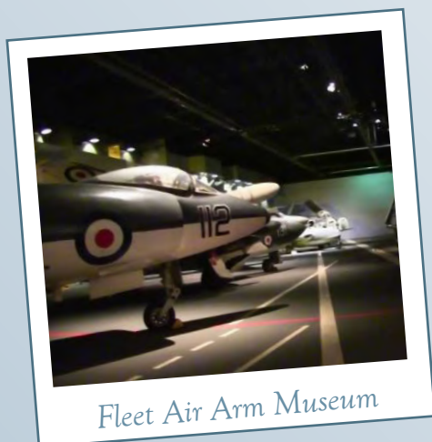
Fleet Air Arm Museum

Two of the best museums the area has to offer are Fleet Air Arm Museum and Haynes International Motor Museum , both located along the A37 towards Yeovil. The naval air museum can be found at RNAS Yeovilton and is Europe's largest naval aircraft museum with flight simulators and much naval history to be explored. Haynes Motor Museum has a large selection of exotic, vintage and super cars on show, perfect for enthusiasts of all ages.