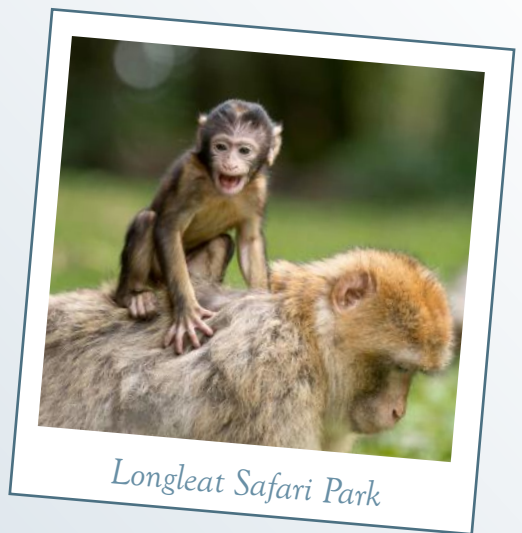
Longleat Safari Park

Approximately 45 minutes away from the property, Longleat Safari Park provides a unique and exciting day out for the whole family. Drive amongst Lions, Rhinos, Giraffes and Monkeys to name a few, before exploring the magnificent house and grounds. You can also make savings by pre-buying tickets in advance through the Longleat website.